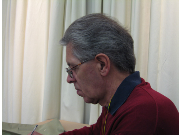
Fig. 1. Brrr....