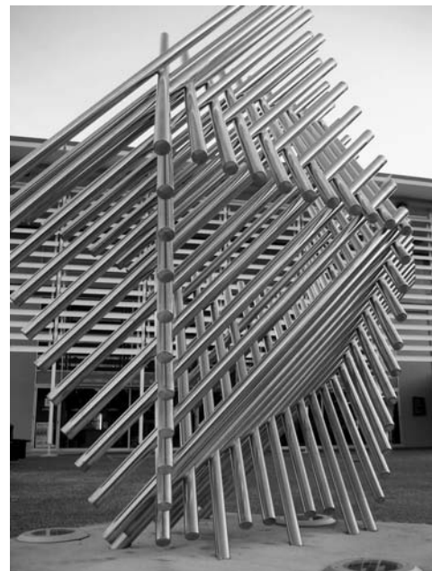
Figure 5: Tohi sculpture based on Lalava structures.

at educational outcomes and relationships with school mathematics curricula.