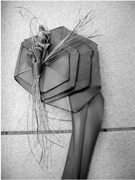
Figure 3: A flax flower.

the contemporary environmental issue of the disappearance of pingao , the grass used for the decorative panels in the whareniui . This reminder of the interconnection between craft with other aspects of life set the scene for a discussion about the origins and social importance of the conventions surrounding weaving. In the workshop we were able to undertake small weaving exercises of a much more creative nature than forming flat mats: flowers and fishes emerged from the long flax leaves.